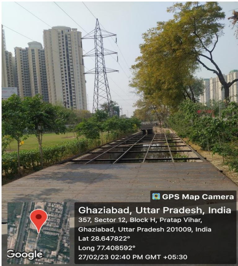
Maintenance of Water Bodies