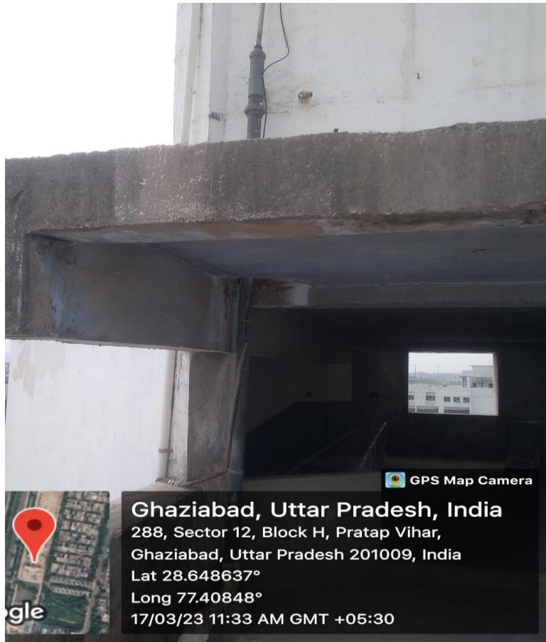
Water Distribution System