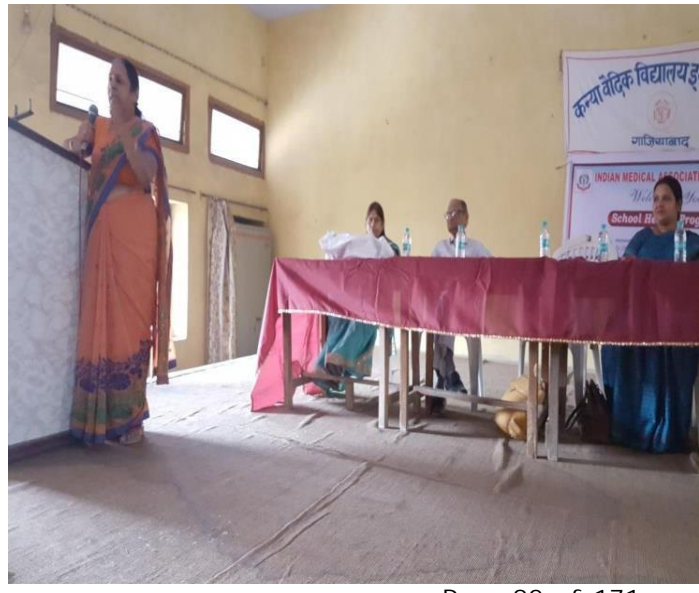
Page 82 of 171