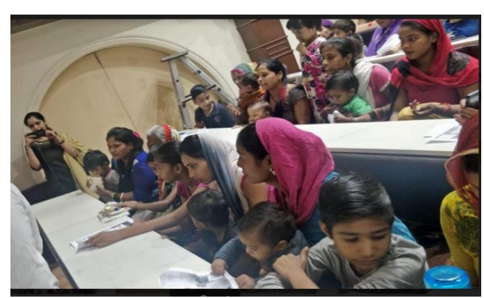
Page 107 of 171